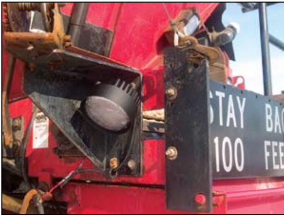
Work light mounted to the rear of a salt truck provides unparalleled illumination and reliability.