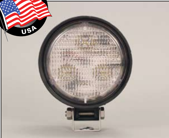
New 500 Lumen PAR 36 LED Work Light is available in Spot, Flood & Trapezoid illumination patterns.