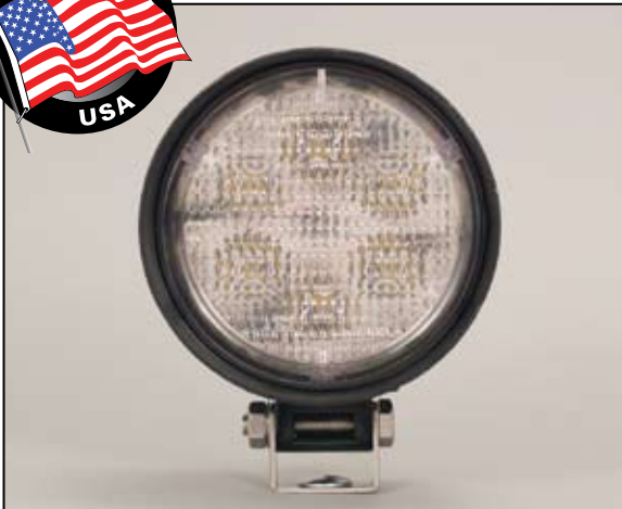
New 1000 Lumen PAR 36 LED Work Light is available in Spot, Flood & Trapezoid illumination patterns.