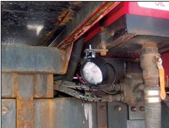
Work light mounted to the underside of a salt truck provides unparalleled illumination and reliability.