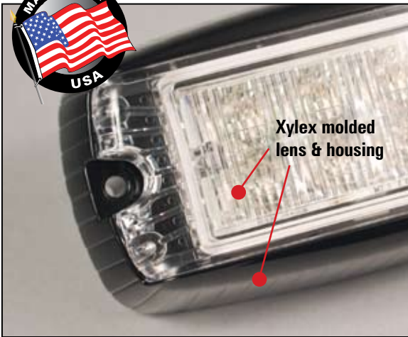
Xylex molded lens & housing

Raptor Single Surface Mount light is made with a durable & corrosion resistant Xylex lens & housing.